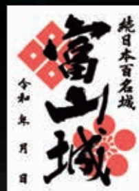
Toyama Castle Stamp